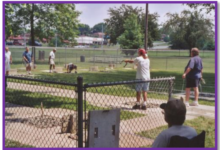
Current Elizabethtown 12-court layout

back to back clay courts with full concrete walkways. Courts 1 & 2 has full handicap accessible concrete walkways. With the new site completed, the E'town Club would host its first State Tournament in 1998. Over the years, the club continued to be on the move when it came to pitching during the winter months, pitching with portable courts in various locations including the MRC building, the ambulance building and the Lincoln Mercury building. Around 1988 or 89, the club began pitching in "The Barn", located on property owned by Lou Pottinger. "The Barn" had three courts insulated and heated by a gas burner. It also included restrooms, a bar and a lounge area. The courts were located on the upper level of the barn on a tongue and groove wood floor. "The Barn" was a popular and known horseshoe hotspot for several years until interest began to die down and members were lost due to the "toll of time". Lou sold the property and pitching at "The Barn" ended in 2003. The Elizabethtown Club has hosted the state tournament four times to date: 1998, 2001, 2010 & 2015. The Club continues to be active in the KHPA but with reduced numbers. The core members currently are: Lou Pottinger, Cecil Cook, Jim Baker, Shelia Williams and Lou's grandsons, Leland and Hadden Fuller, representing the younger generation!