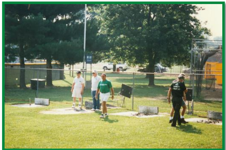
Original Elizabethtown 8-court layout