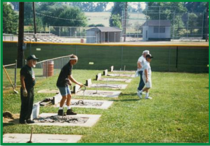
Original Elizabethtown 8-court layout

court layout would remain a constant on the KHPA schedule through the 1997 season. During this time the club wished to move the location of its current set of courts due to the close proximity to the parks youth baseball fields. The courts were deemed unsafe, as balls were frequently being hit onto the court site with the youth running after them. Lou Pottinger stated that a ball once hit Omar Blacketer in the heel during a horseshoe event and it had a lingering effect on Omar's pitching the rest of the year. (You can see the baseball fields in the background of the photo to the left.) The E'town Club evolved over the years in its membership from the 80's through to when the new courts were built