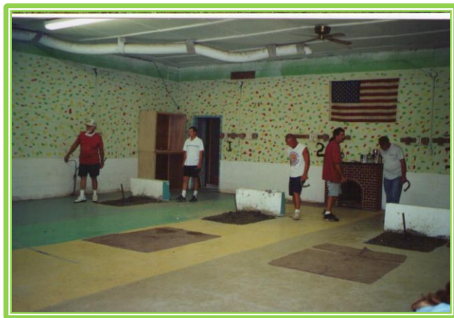
Courts 1, 2 & 3 as seen in the 2003 Men's State Championship