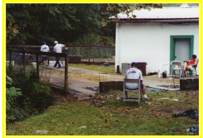
Courts 4 & 5 (above), Courts 6-9 (below)