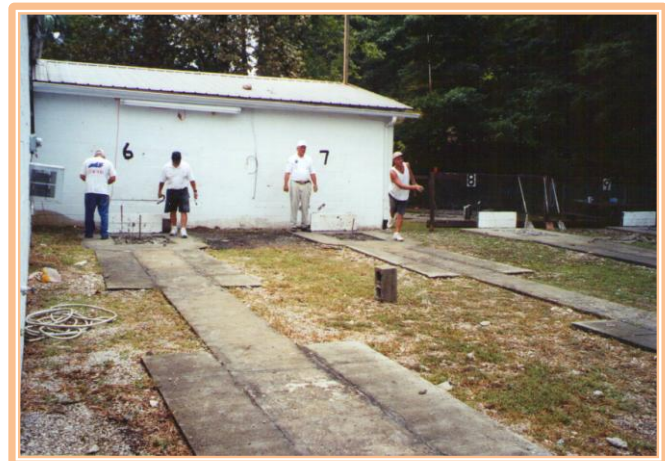
Courts 10, 11 & 12 (below)