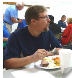
Visits From The Horseshoe Family!