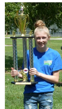
2018- Jr. Girl's State Champ & 5 th in the World.