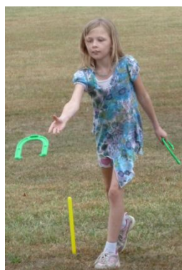
2011- Practicing at the State... sidelines with plastic shoes.