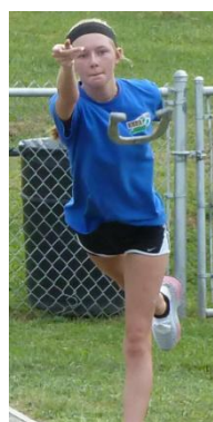
2019- Junior State Runner-Up.