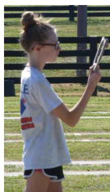
2016- Junior State Runner-Up.