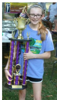
2015- Junior Girl's State Champion.