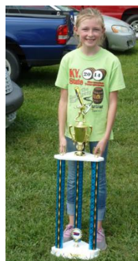
2014- Junior Cadet State Champion.